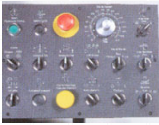
Convenient Pendant Mounted Operator's Control Station.

Marvel Mfg. Co., Inc. offers a Vertical Bandsaw, a Metal Cutting BandSaw and a 60 ° tilt Vertical Band Saw, plus the entire Spartan Metal Band Saw line of Spartan Metal Cutting Bandsaw, the Spartan Metal Bandsaw, Plate Saw, Ironworker and the Carbide Tip Circular Saw. The Marvel Bandsaw has been manufactured in the United States for 100 years. Let us supply your Marvel 2125 and Marvel 2150 and Band Saw Blade. APC PCII APC60 2150apc