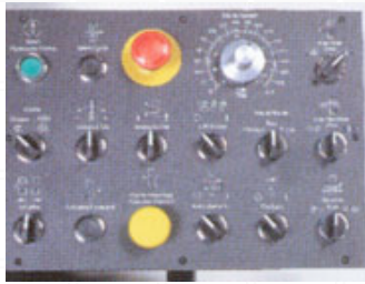
Convenient Pendant Mounted Operator's Control Station.

Marvel Mfg. Co., Inc. offers a Vertical Bandsaw, a Metal Cutting BandSaw and a 60 ° tilt Vertical Band Saw, plus the entire Spartan Metal Band Saw line of Spartan Metal Cutting Bandsaw, the Spartan Metal Bandsaw, Plate Saw, Ironworker and the Carbide Tip Circular Saw. The Marvel Bandsaw has been manufactured in the United States for 100 years. Let us supply your Marvel 2125 and Marvel 2150 and Band Saw Blade. APC PCII APC60 2150apc