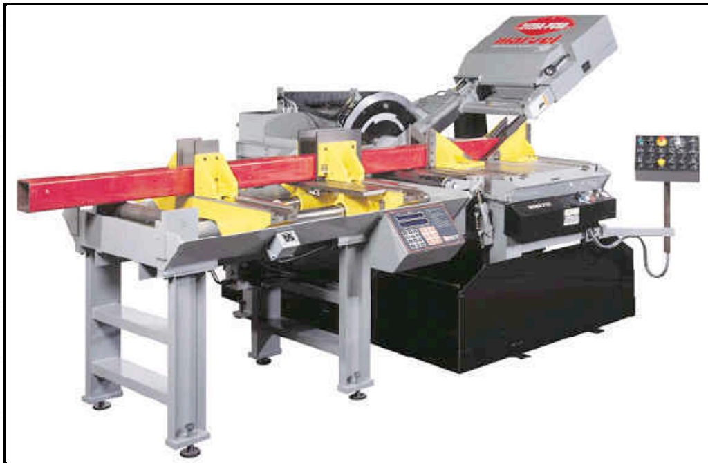
Shown with standard 24" shuttle and optional 2nd machine vise and outboard shuttle vise.